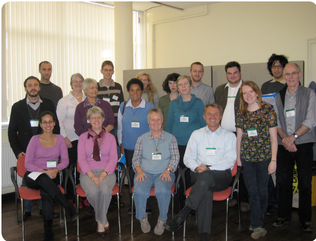
AVID members at the Coordinator's Conference, Birmingham, November 2010