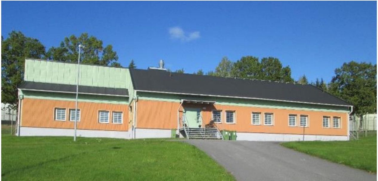
Pavilion 2 at Mariefred prison, home to 20 foreign prisoners