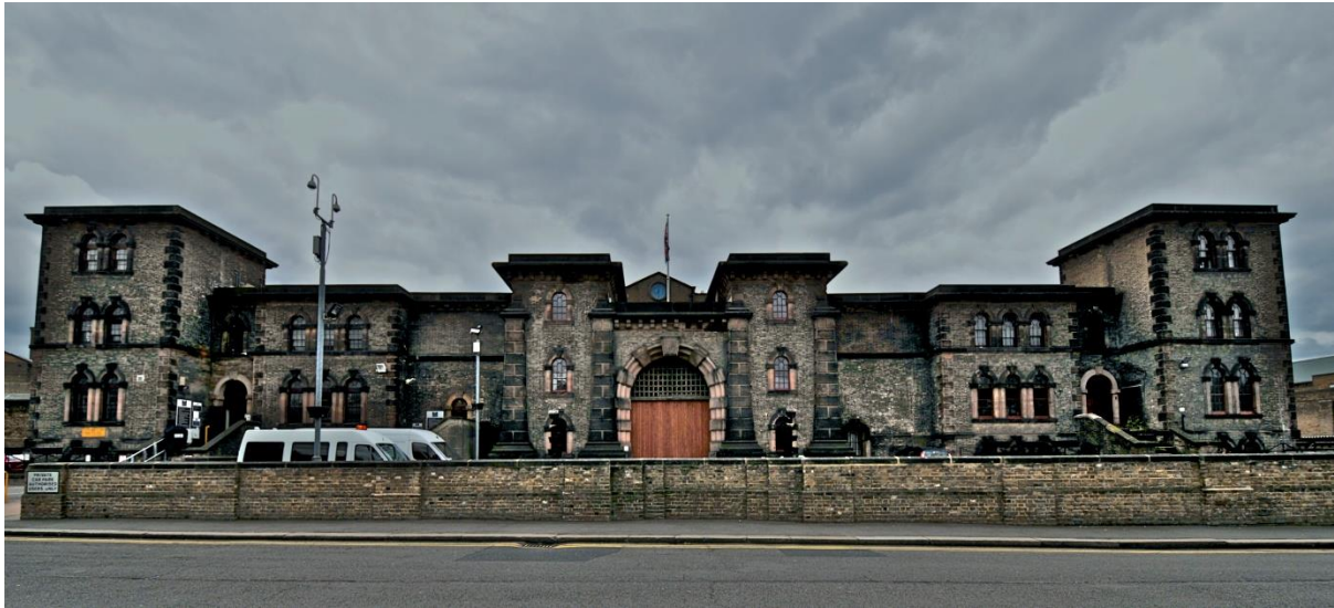
HMP Wandsworth, London

HMP Wandsworth in south London is a Victorian Cat B local prison. It holds around 1,630 male prisoners, more than any other prison in UK. It is unacceptably crowded. Prisoners live in shared cells which are cramped. The population is typical of other inner city local prisons; there is a high incidence of mental health problems and substance misuse. The prison, which serves the London courts, is busy. There are 2,000 prisoner movements through reception each month 2 .