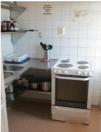
Kitchen in Pavilion 2, Mariefred prison