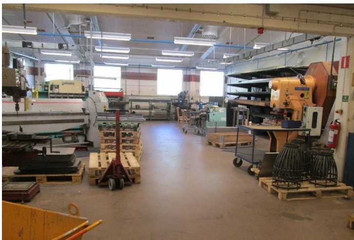
Welding workshop at Mariefred prison

Perhaps the most impressive feature at Mariefred was training offered to foreign prisoners. Since 2014 foreign prisoners can learn how to weld iron in a new training workshop. Welding, Mohammed says, is a skill that can be used wherever a prisoner goes back to. 'I'm from Africa myself. I remember people building gates, building beds, making buckets for water, pans for cooking, repairing cars. These skills are still needed in Africa, South America and in Eastern Europe. I had a post card the other day from a prisoner who's back in Gambia and just about to open his own business. He can do something that will keep him out of prison'. The training course lasts four months; those who complete the course receive a certificate and can then work to produce fire baskets which are sold locally.