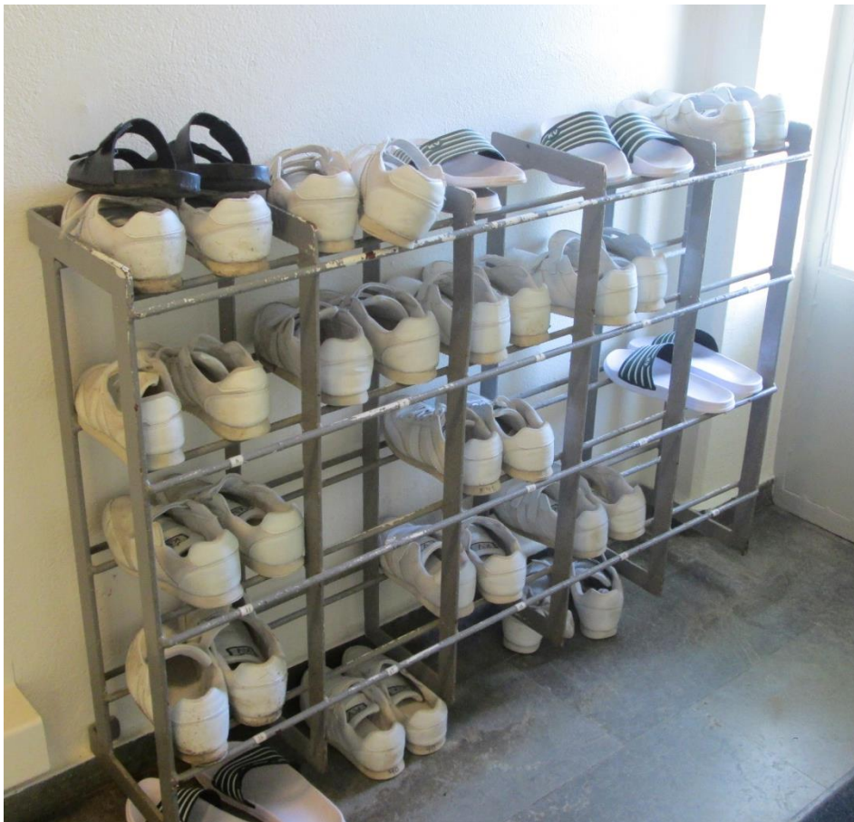
Entrance hall, foreign national Pavilion, Mariefred prison, Sweden