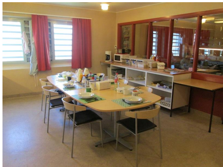
Table set for evening meal, Mariefred prison

Prisoners had in-cell television with a choice of 25 television channels including foreign language channel, CNN, BBC, Al Jazeera and a sports and film channel. The channel choice is reviewed every six months and then adapted to the population. Every weekend three foreign language films are selected which can be watched individually or as a communal activity.