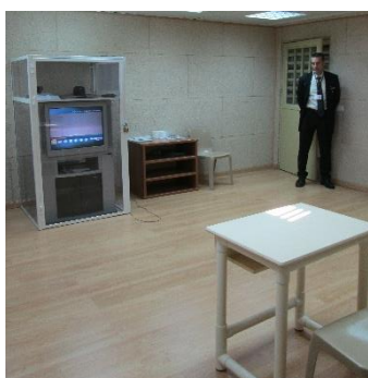
Skype/video conference facility at Madrid V, Spain

In spite of these problems it seemed clear that there are significant benefits for foreign prisoners. It is relatively inexpensive. The attraction for prison authorities is that video or Skype visits require fewer staff and reduce the risk of contraband entering the prison.