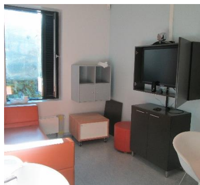
Skype suite, Haldane prison, Norway