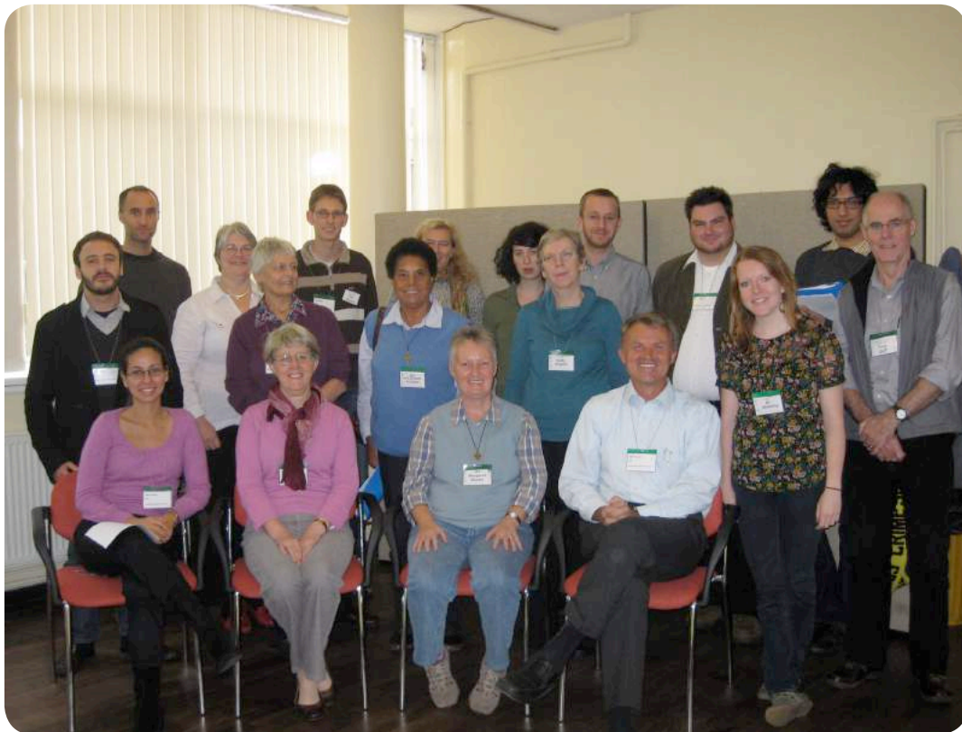
AVID members at the Coordinator's Conference, Birmingham, November 2010